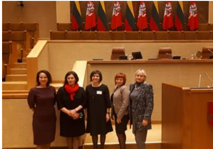
Le congrès international 2018 "F(f)rancophonie durable : le rôle de l'enseignant" à Lietuvos Seimas (membres du bureau de l'ALPF)

français, de l'Ambassade du Canada, du ministère d'éducation et d'enseignement et des associations des langues y sont invités.