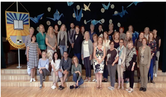
L'Université d'été 2018 à Palanga

L'Université d'été organisé par l'association depuis 2016 attire par son actualité et un vif intérêt des professeurs lituaniens.