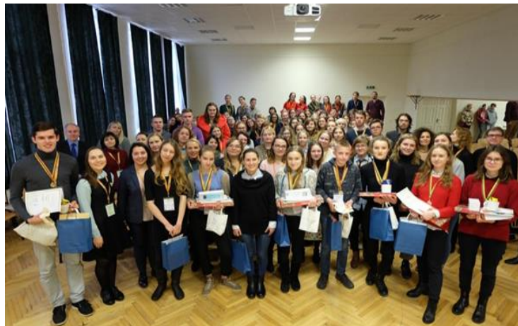
L'Olympiade nationale de français 2019 à Palanga.