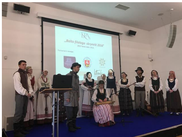
The Baltic Philologist Coffret Nomination (March 2017)