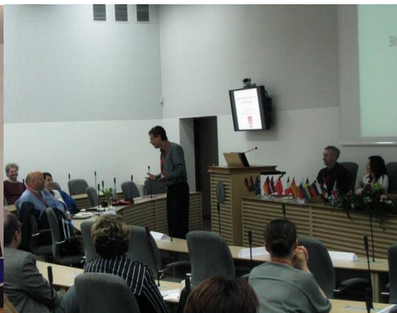
VDU and LKPA international conference (May 2017)

In cooperation with its Founding members (see more at http://www.lkpa.vdu.lt/about-language-teachers-association/ ), LKPA holds its annual international conferences (average number of participants 100-140), which strengthens networking and provides opportunities for professional development and cooperation. Here are some recent examples: