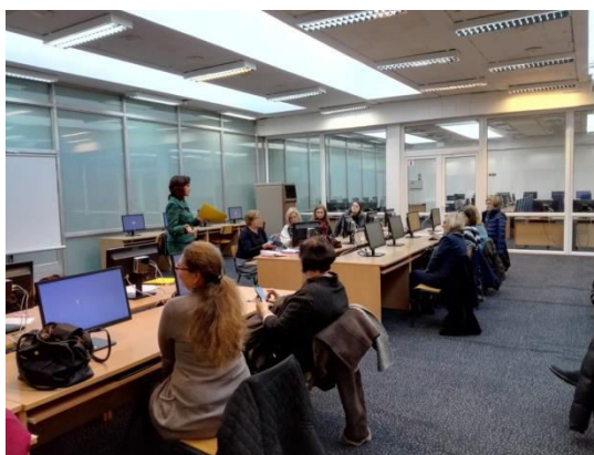
“Google doc. as a Teaching Tool” workshop (January 2018)

The activities of the Association address professionals, policy makers, and the general public; LKPA works in various formats: discussions and debates on language policy in formal education, teacher training workshops and seminars across Lithuania, public events to promote languages and cultures.