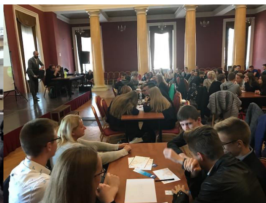
The European Day of Languages event in the Vilnius City Hall (September 2017)